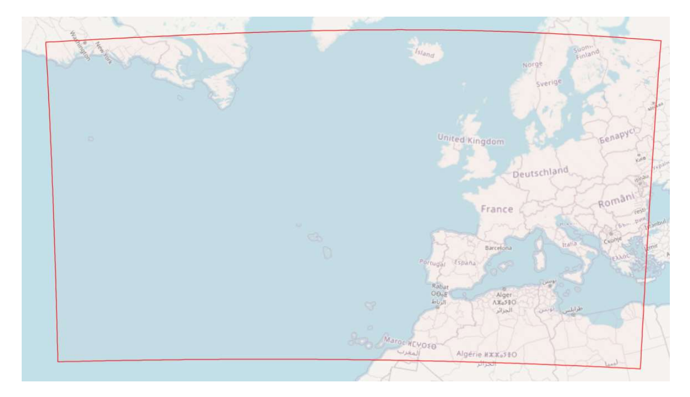
Figure 2 HCLIM domain used for Ophelia simulations.

The present and "future" simulations have visible differences, in track (figure 3) and minimum pressure (figure 4) but single experiments such as this are not sufficient to draw any conclusions. The aim of this project is a more thorough investigation.