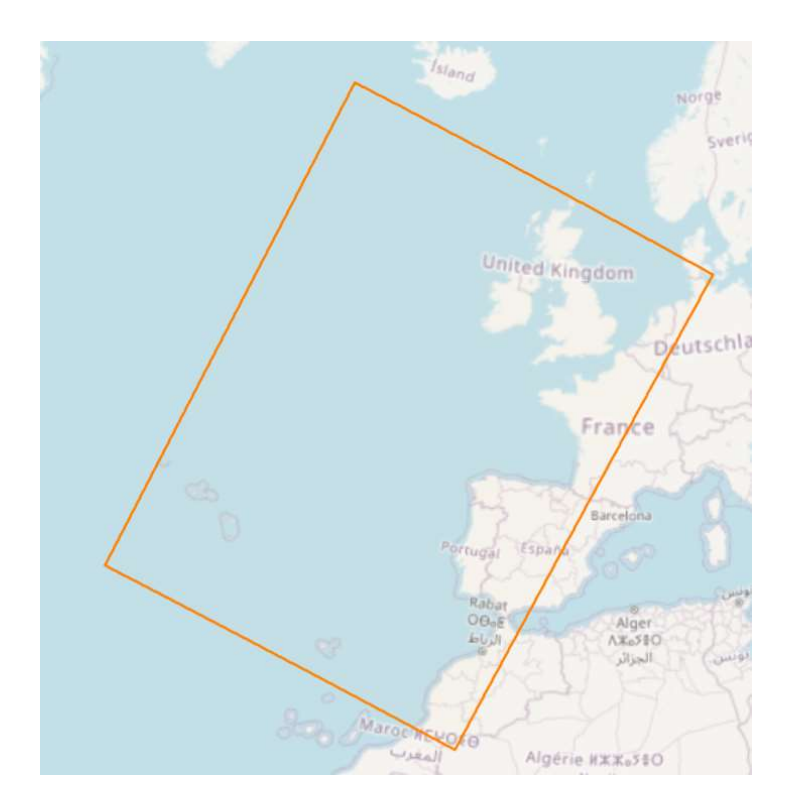
Figure 1 HARMONIE-AROME domain used for Ophelia simulations

Some tests were already carried out at Met Éireann following Attema et al. (2014), in which Storm Ophelia was simulated with HARMONIE-AROME driven by IFS boundary conditions modified with a -1, +1, +2, +3, and +4 degree perturbation added to the SSTs and air temperatures. In addition, tests with HARMONIE CLIMATE ('HCLIM') driven by ERA5 boundary conditions modified with the same perturbations as above were completed. These tests were conducted on large domains (see figures 1 and 2) ensuring that all stages of storm development were captured.